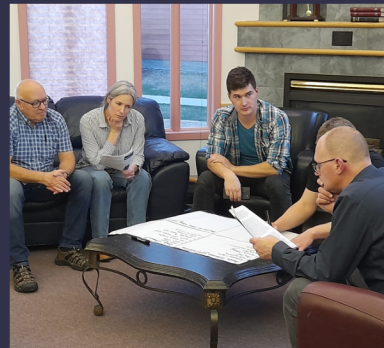
Helping without Harming Workshop at Covenant CRC, Winnipeg

My biggest joy is running a Deacon 101 workshop and re-viewing the deacon's mandate with them - the rookies and the experienced ones. Seeing the 'lights' come on as they realize what all is involved in the calling to be a deacon. I can personally attest to that, it took this workshop for me to fully appreciate the critical role the diaconate has in the church and in God's Kingdom!