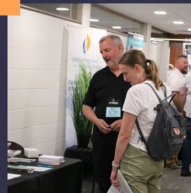
Attending Synod and hosting the annual Deacons Dinner on Monday, June 12.

Workshops & training events with deacons across Canada