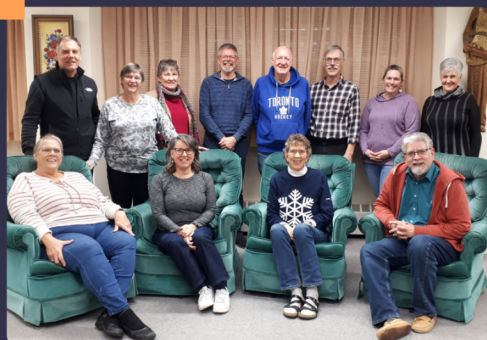
Our Annual Diaconal Coaches Retreat was held January 25-28.