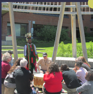
Four staff members attended the Canadian National Gathering in Ottawa, ON, from May 25-28.