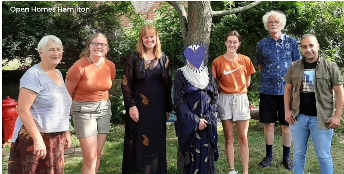
Open Homes Hamilton

In partnership with Immanuel CRC, Simcoe, ON.