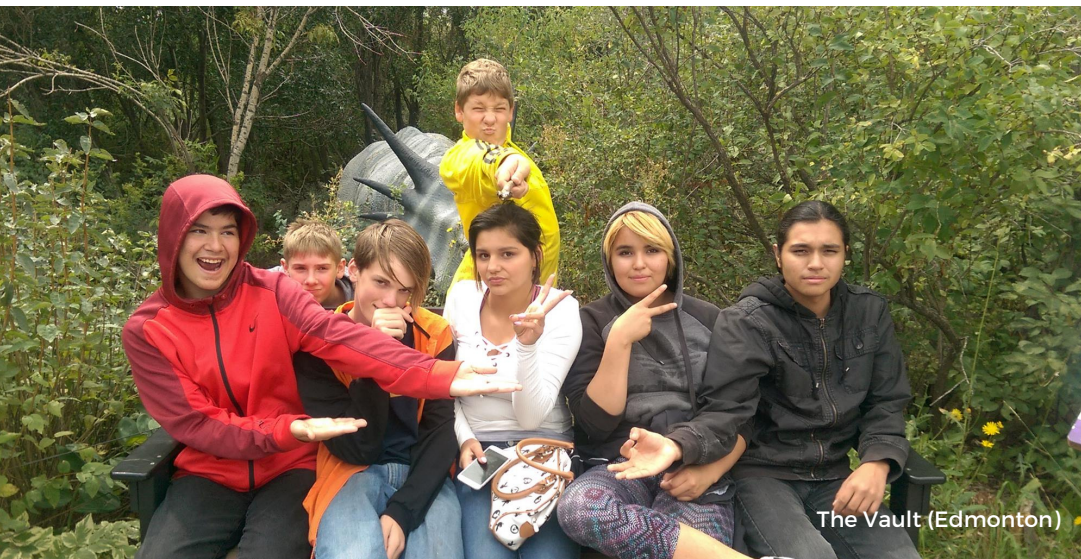
The Vault (Edmonton)

In partnership with Crosspoint CRC, Brampton, ON.